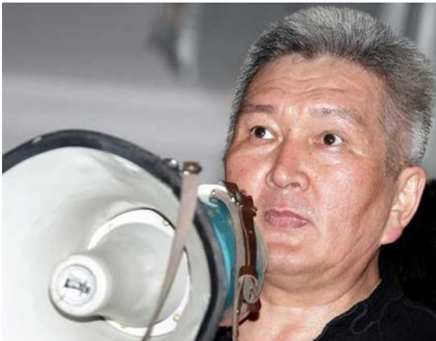
Kulov: Getting Ready to Broadcast His Message?

sectors, and attempts to change it have had little success. On the other hand, Kulov justified his failure to bring reforms by saying that sometimes, he had to prioritize an atmosphere of domestic stability and the country's image abroad before the option of direct confrontation with the "faulty"