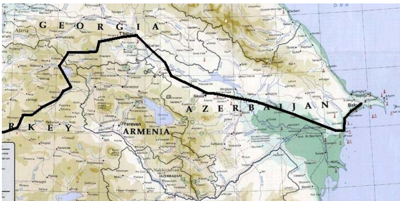
Approximate Route of the Kars-Akhalkalaki-Tbilisi-Baku Railway

This financial windfall is linked with Azerbaijan’s stunning oil-fuelled economic growth, which is estimated to reach 34 percent this year. But Turkey and Georgia are also actively partnering bilaterally.