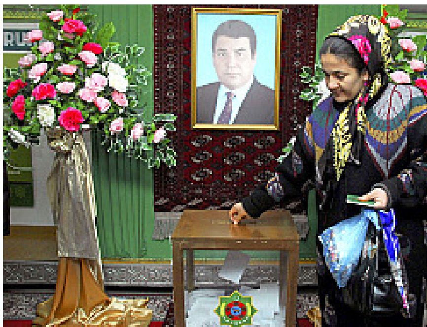
Festive Voting for President in Turkmenistan

about only minor reforms limited to some adjustments in education and to allowing the general population to have access to the Internet. Thus, some observers might dismiss him as another